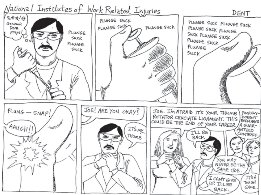
Figure 1 | Another reason for small experiments. This cartoon was kindly provided by Alexander Dent, http://dentcartoons.blogspot.com .

Having such a lead isn't always possible, but you should always aim to have a novel approach to your research question, even if your approach is a bit oblique.