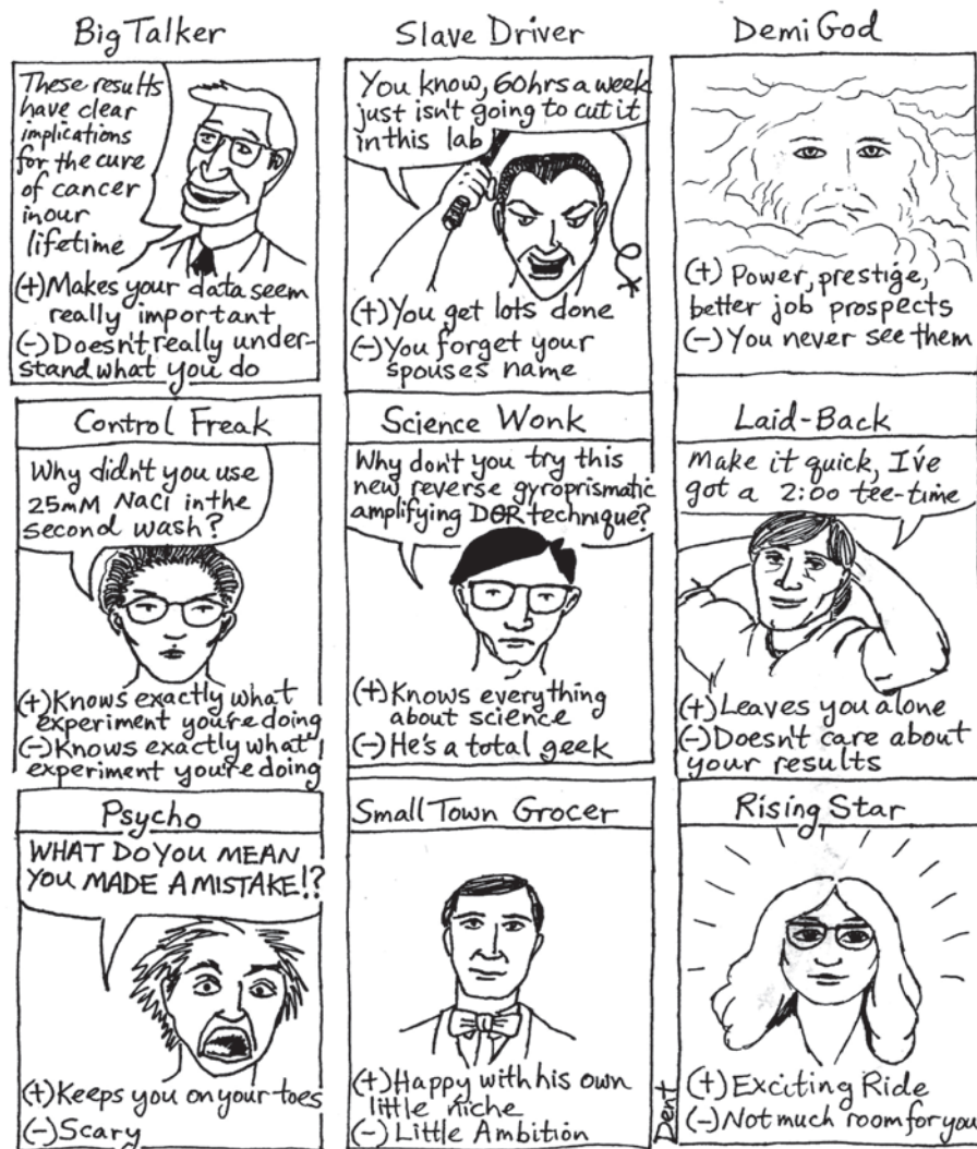
Figure 2 | The nine types of principal investigator. This cartoon was kindly provided by Alexander Dent, http://dentcartoons.blogspot.com .

Skills, not papers. Contrary to what you might have heard, it is not critical to have a spectacular publication record from your Ph.D. When the time comes to apply for a tenure-track job, the selection committee will focus on the productivity and promise you displayed during your postdoctoral fellowship. Furthermore, a solid Ph.D. with one good first-author paper that is based largely on your own work is all that is usually required to obtain the postdoctoral position of your dreams, particularly for citizens of